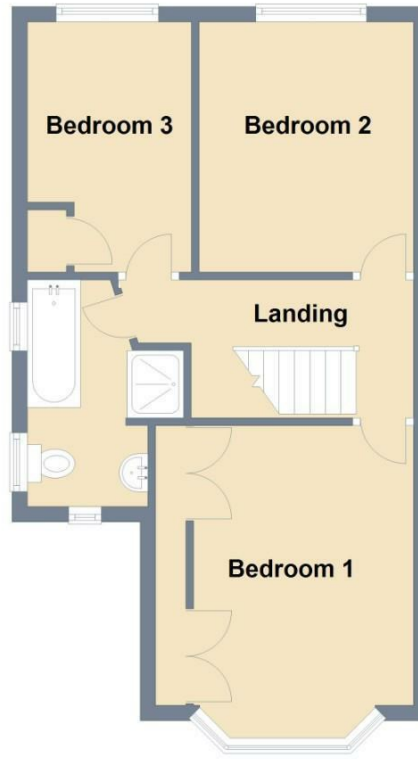
Total area: approx. 110.5 sq. metres (1189.6 sq. feet)